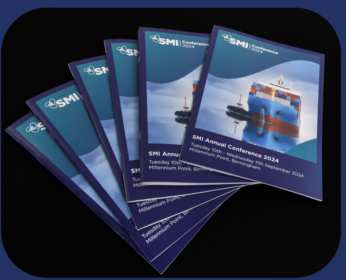
Conference Brochure Advert