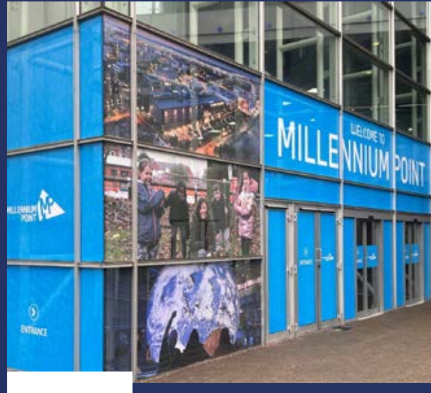
Car Park Entrance Branding (A)