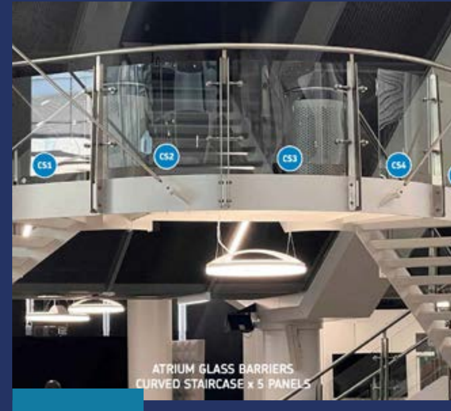
Staircase to Auditorium Logo Decal (E)