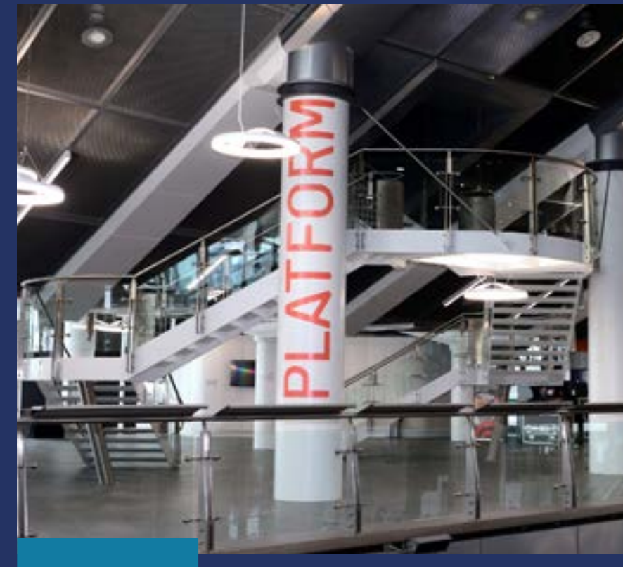
Platform Column Vinyl (F)