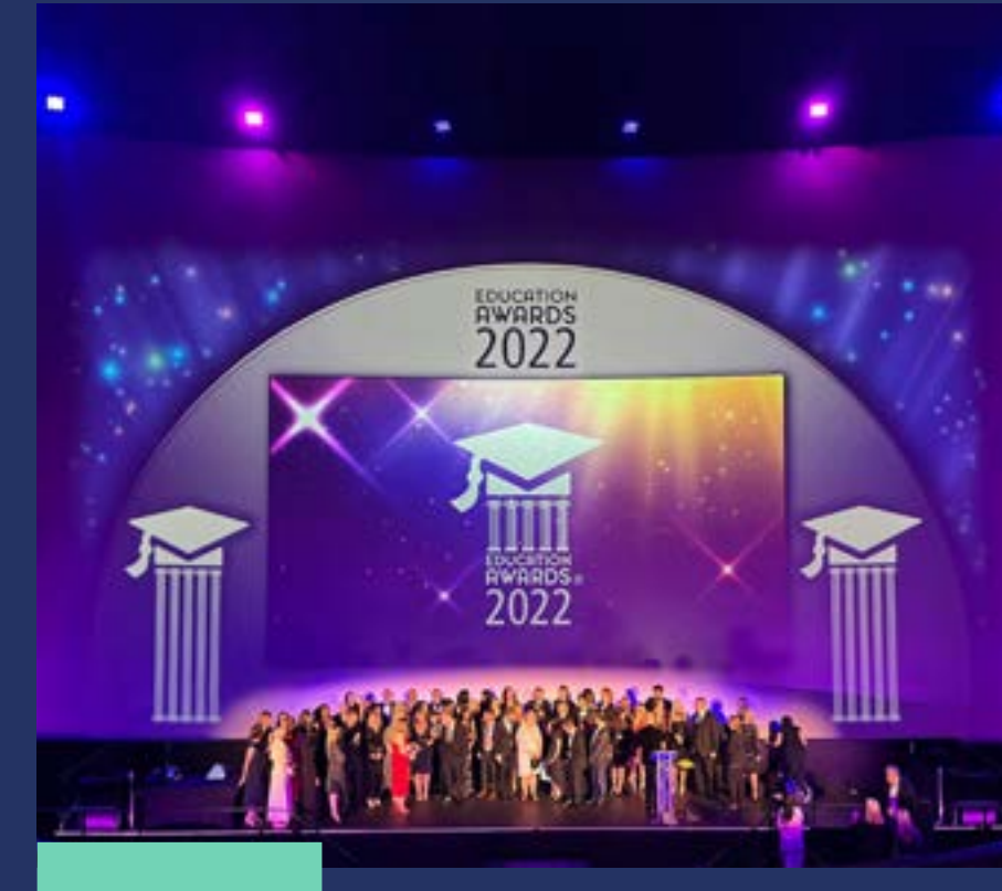
Logo included in Holding Screen Event Frame (G)