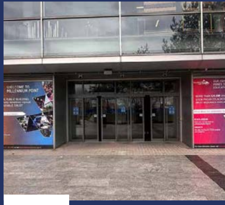
HS2 Facing Entrance Branding (B)