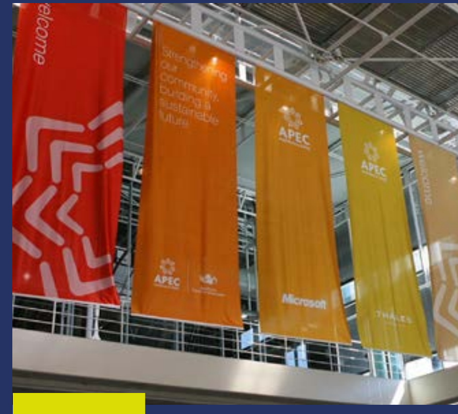
Hanging Banner (D)